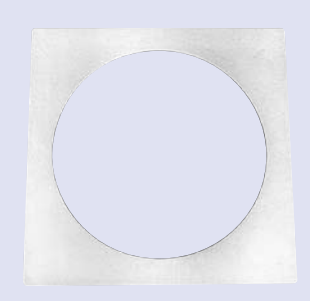
Square deck ring seat