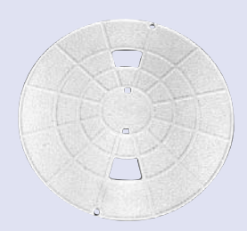
Deck lid—available in white, tan, black, dark gray, and gray