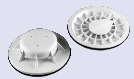
Float valve assembly